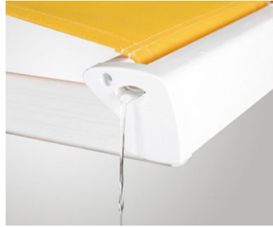
Front rail gutter