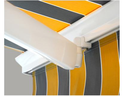
Front bar attachment