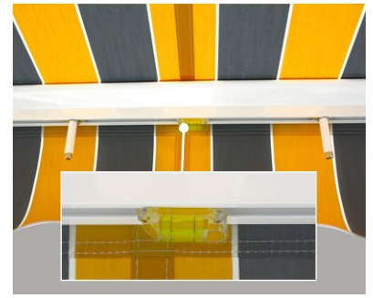
Front bar spirit level