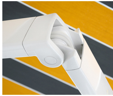
Features tensioned and spring loaded pvc coated twin stainless steel cables